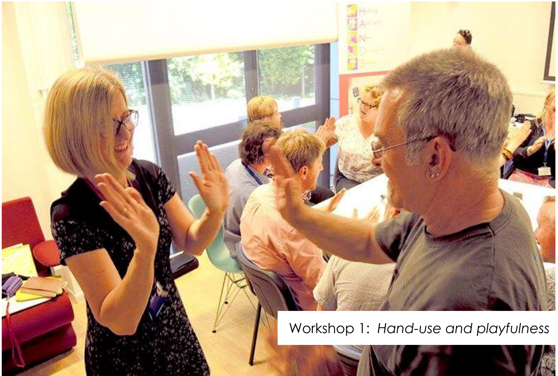
Workshop 1: Hand-use and playfulness