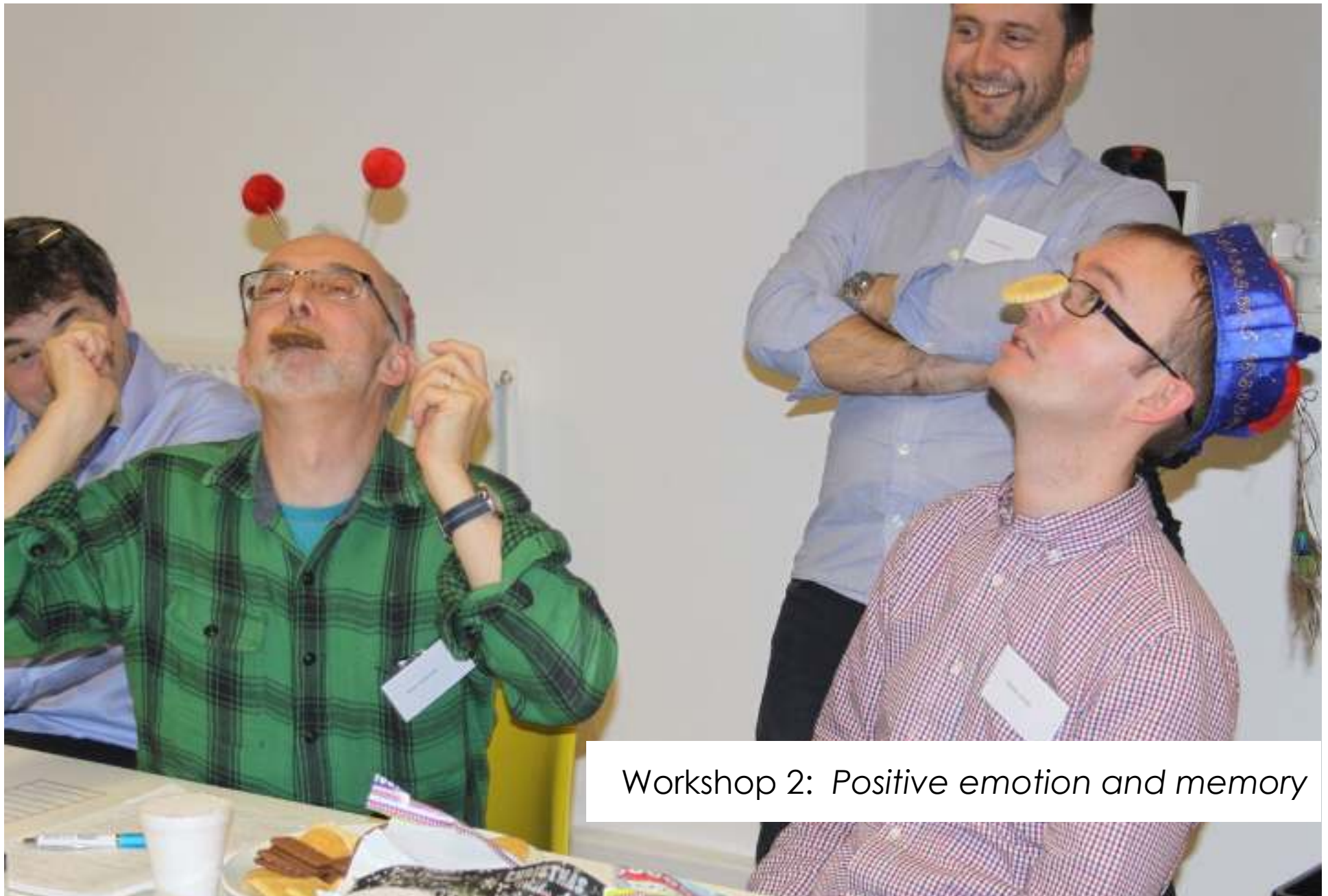
Workshop 2: Positive emotion and memory