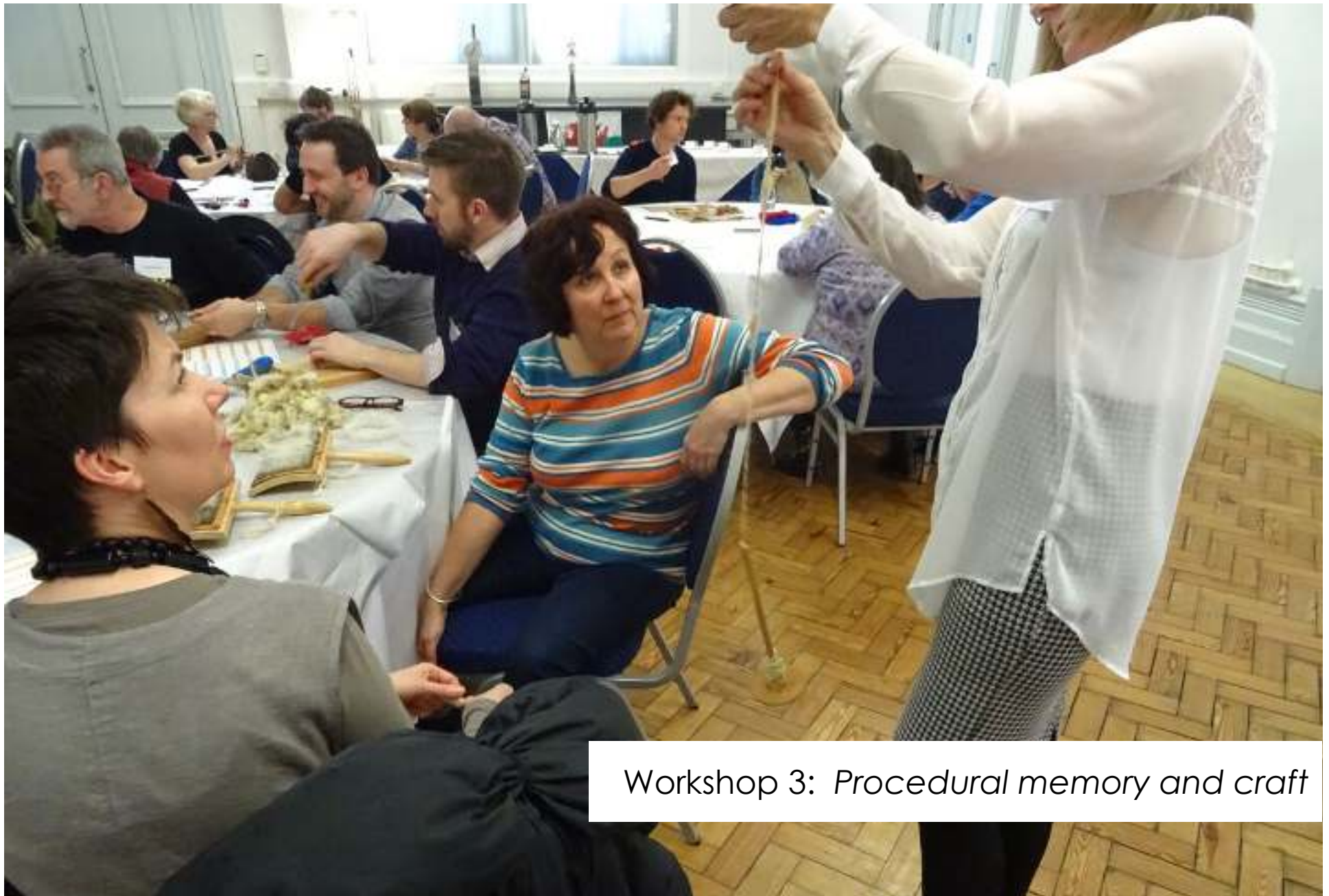
Workshop 3: Procedural memory and craft