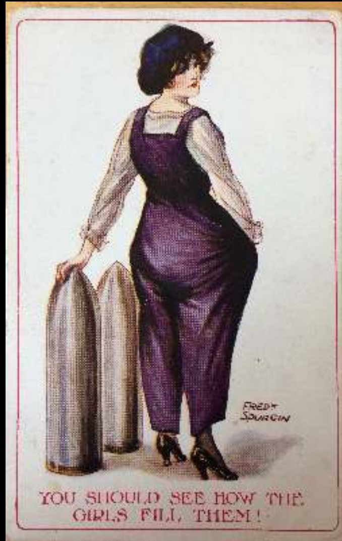
Author's own postcard