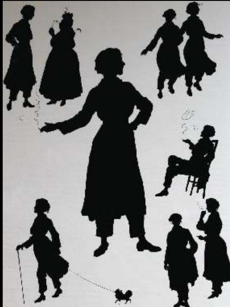
Silhouettes by in The Georgetown Gazette.